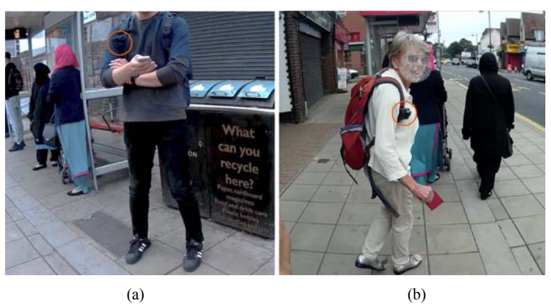
Figure 3 Illustration of (a) the observer and (b) the participant with the action cameras (orange circles)

The observation began from participants' outward journey to the chosen supermarket to identify any psychosocial aspects during the travelling to the supermarket such as the choice and experience of travel by taking public transportation, driving, or walking. In the supermarket, all the shopping experiences of the participants were observed for example any situations such as dropping items from the shelf, meeting other people, etc. For the same reasons as that of outward journeys, the participants' journeys from the supermarket to their home were also observed after participants completed their shopping. Each observation took approximately one hour. Figure 4 shows an illustration of the actual observation.