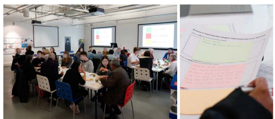
Figure 2 Illustration of the creative workshop (see online version for colours)

After each discussion session, the participants shared identified issues and insights by creating post-it notes. Theses post-it notes were categorised into three themes including 'like' (positive aspects of the participants' shopping experience)', 'dislike' (negative aspects of the participants' shopping experience), and 'to be improved' (aspects be improved in the participants' shopping experience). These three categories were used to focus attention in this investigation. Figure 2 illustrates the actual creative workshop.